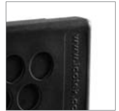
Also available in black.